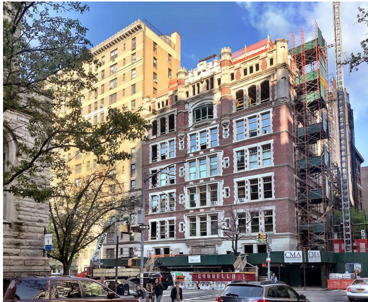
Construction at 555 West End Avenue in May 2018

555 West End Avenue is the latest in a long line of schools that have been converted to residential buildings in some of New York's most desirable neighborhoods.