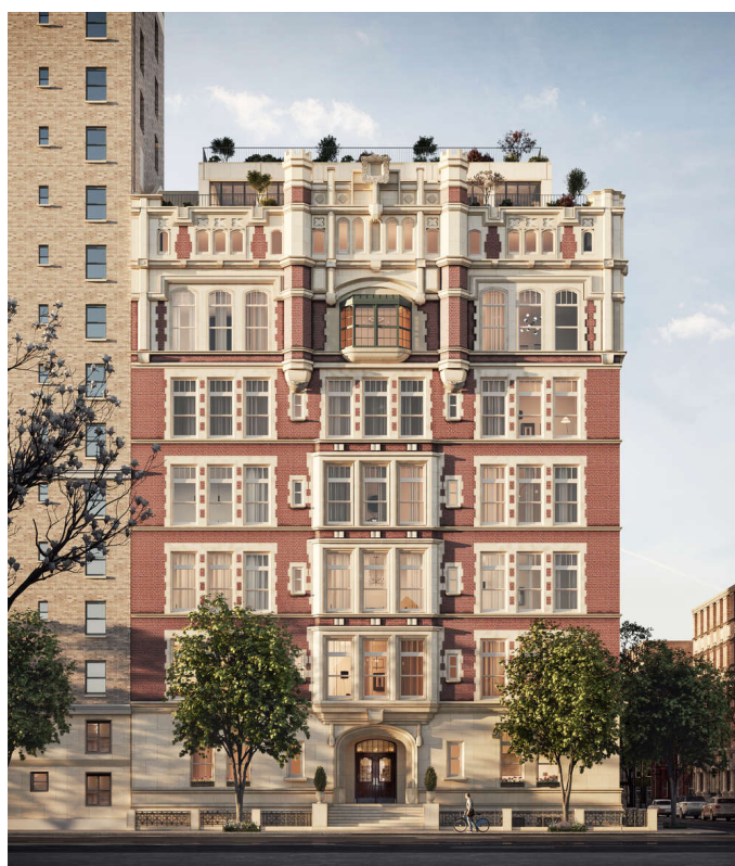
555 West End Avenue