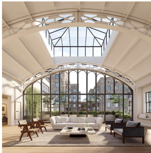
The Solarium living room

Regardless of layout, all interiors offer refined palettes, inviting entry foyers, bright and expansive Great Rooms, soaring ceilings, towering windows, excellent closet space, and abundant natural light. Kitchens are outfitted with hand-crafted cabinetry by Christopher Peacock, marble slab countertops and backsplashes, and top-of-the-line appliances. Marble master baths are adorned with Lefroy Brooks fixtures and white oak vanities by Christopher Peacock.