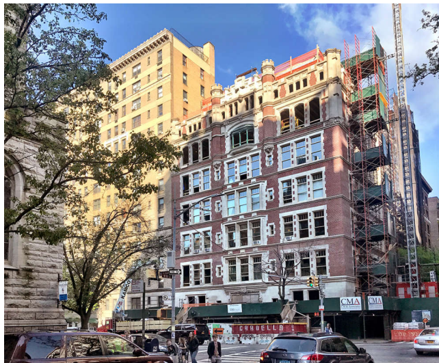
555 West End Avenue circa October 2018

Weeks after school started, sales have launched on the much-anticipated condo conversion at 555 West End Avenue, a former Catholic school. Originally built by William A. Boring in 1908, Upper West Side residents and visitors have long admired its architectural details, filigreed windows, limestone window bays, and turrets. Over 100 years later, with Landmarks' blessing, architect and developer (in partnership with CL Investment Group) Tamarkin Co. restored the historic building to its former glory while adding a discreet penthouse and turning the institutional interior space into luxurious homes.