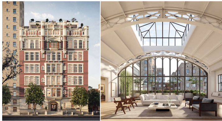
555 West End Avenue rendering